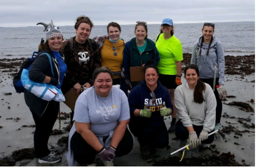
SNHU volunteers at Foss Beach in Rye, NH

A total of 72,565 items were collected, weighing 3,951 pounds .