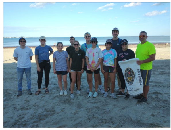
Triumverate Environmental staff at Revere Beach in Revere, MA.