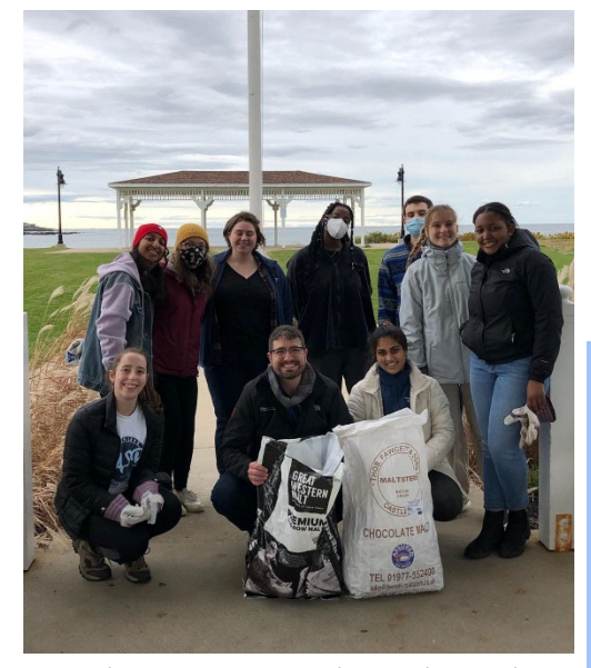
Southeastern University students at Short Sands Beach in York, ME.

Merrimack High School Monarch School of New England Navico NEMO NH Climate Action Northeastern University Ogunquit Rotary Club Piscataqua Savings Bank Portsmouth High School Prospect Mountain High School Rye Beach Committee Santley Family Seacoast Science Center Smith & Nephew Southern New Hampshire University Sprague Energy The Concept Project Timberland Triumverate Environmental UCC HS Youth Group UNH Environmental Action Club Unlimited Possibilities Vapotherm Westinghouse Electric Whole Foods Market