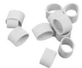
Lobster bands: Thick, small rubber bands