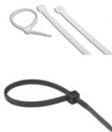
Zip-tie/cable tie: Plastic fastener; may be open or closed