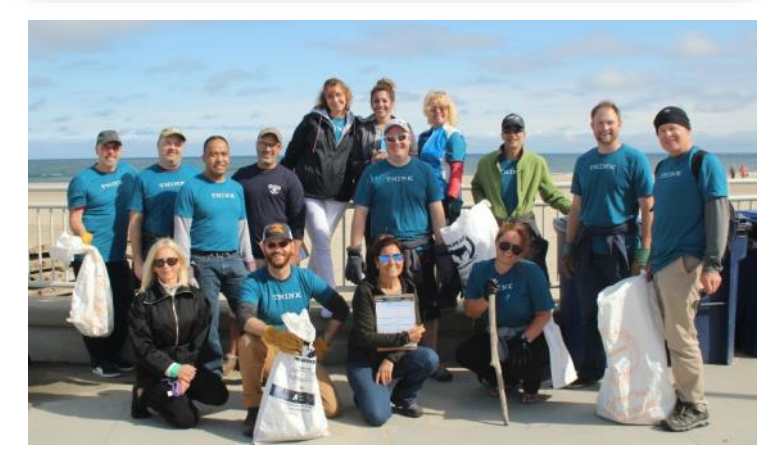
Volunteers from The Weather Company after a cleanup at Hampton Beach in 2019