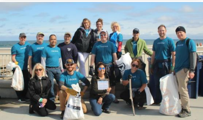
Volunteers from The Weather Company after a cleanup at Hampton Beach in 2019