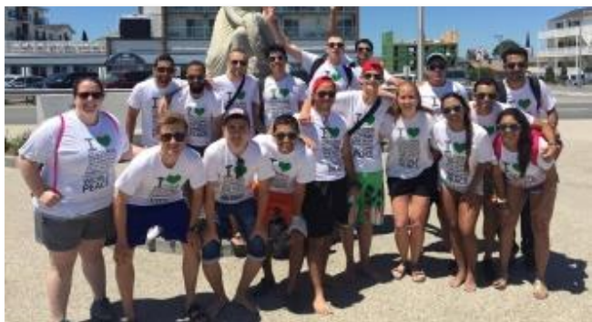
Hampton Beach cleanup volunteers from Greenheart Exchange