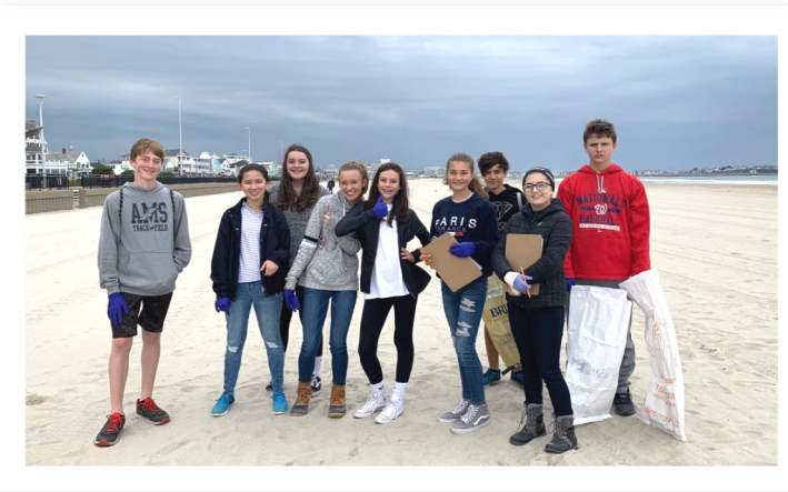
Cleanup volunteers at Hampton Beach, October 2018