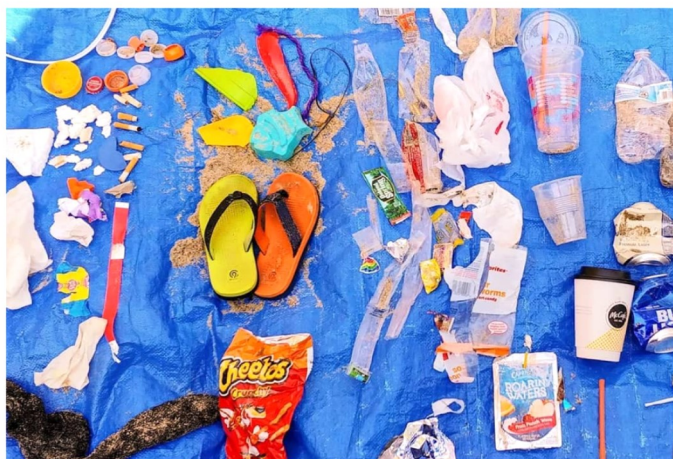
Litter picked up on Hampton Beach, August 2018