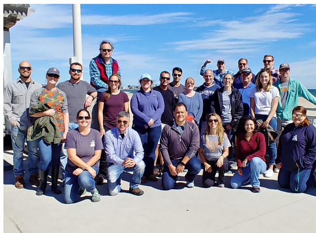
Volunteers from Illumina pose for a photo after a cleanup at Hampton Beach in September 2018