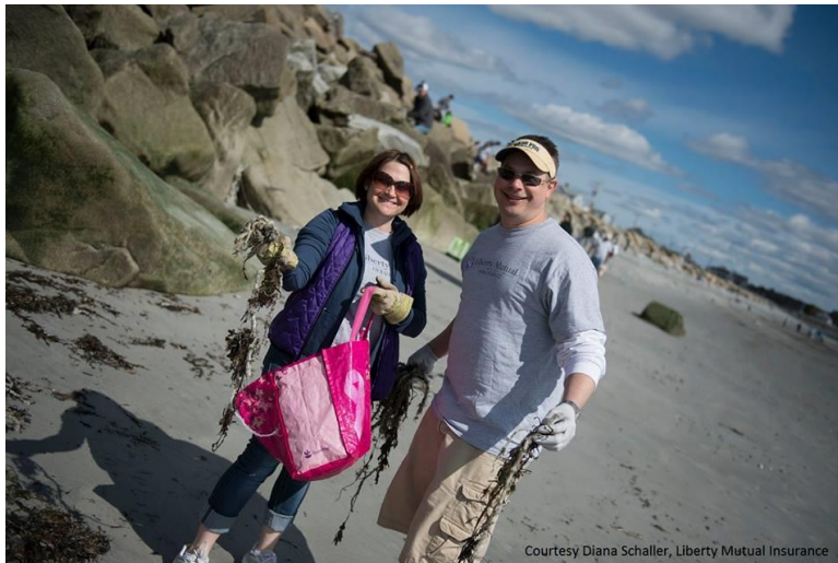
Volunteers from Liberty Mutual picking up rope from Foss Beach in May 2015.

We look forward to an enjoyable day of working with you to help the marine environment!